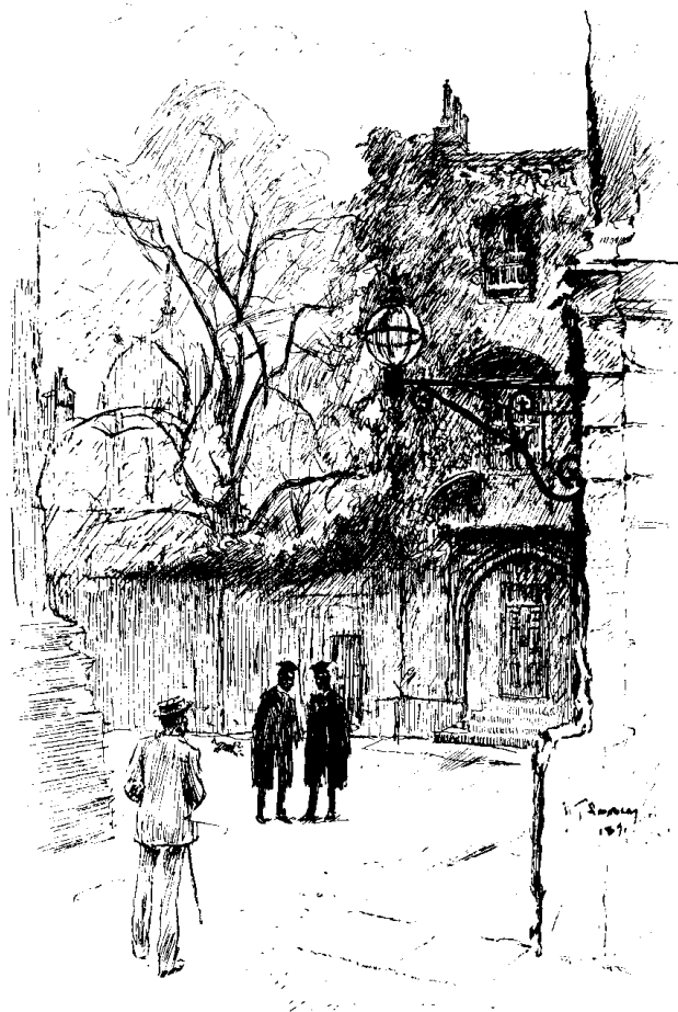
THE CORNER TURRET.

heavy arch which spans the open door has bent downwards in the centre under the weight of its years, and the gray lichen-blotched blocks of stone are bound and knitted together with witles and strands of ivy, as though the old mother had set herself to brace them up against wind and weather. From the door a stone stair curves upward spirally, passing two landings, and terminating in a third one, its steps all shapeless and hollowed by the tread of so many generations of the seekers after knowledge. Life has flowed like water down this winding stair, and, waterlike, has left these smooth-worn grooves behind it. From the long-gowned pedantic scholars of Plantagenet days down to the young bloods of a later age, how full and strong had been that tide of young English life! And what was left now of all those hopes, those strivings, those fiery energies, save here and there in some old-world church-